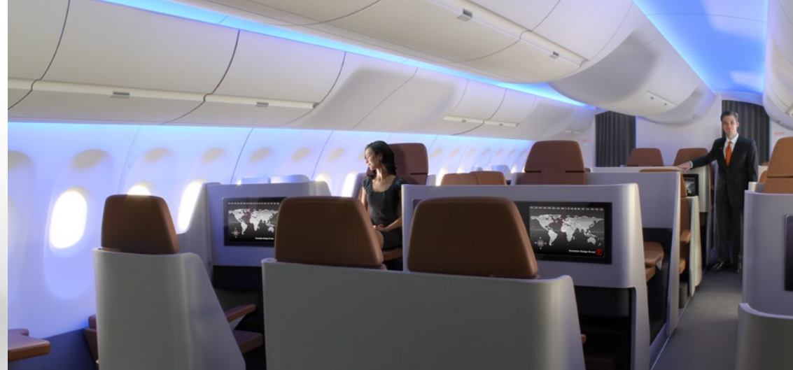
A330/340-300 forward cabin model

The first of these was demonstrated at the 2010 AIX Americas within a scale model of an A330/340-300 forward cabin. The configuration featured 32 fully lie-flat seats arranged between door one and door two. All seats in this LOPA feature direct aisle access and 79 inch long lie-flat beds.