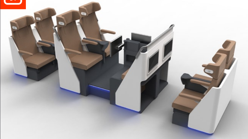
Illustration of the original embodiment

The concept is the result of intensive geometric analysis of cabins in existing and planned airframes. The seating arrangement provides legroom for two seats under a centrally located raised seat and bed area. As a result, one of the lower seats and the upper seat are forward facing with one of the lower seats aft facing. Formation applied for patent protection of this innovation in early 2008. The above rendering illustrates the basic embodiment of this concept which is also seen in the cabin mock-up center row and the center row of the A330-300 LOPA shown on the next page.